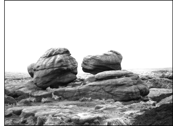
The "Kissing Stones"; near the summit of Bleaklow